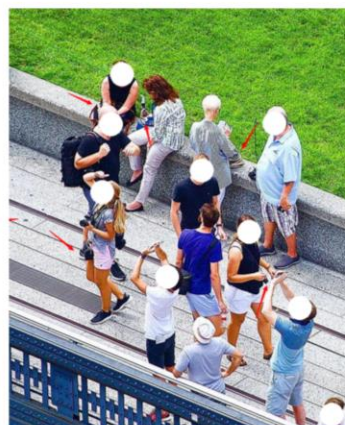
f. cannot detect small handbags