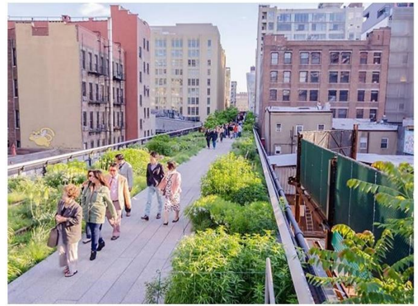
Figure. S1. Scene from Atlanta Beltline Park(left) ; Scene from the High Line Park (right)