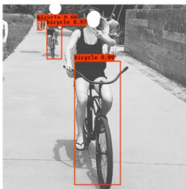
b. bicycle objects are accurate