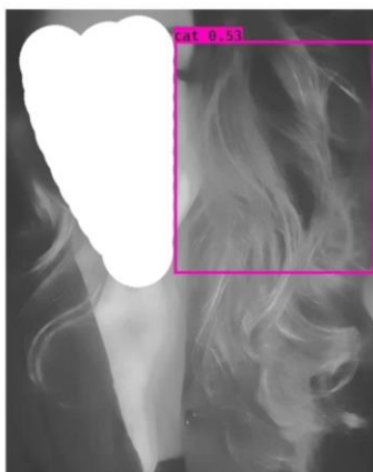
d. human hairs as cat