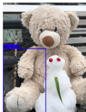
c. furry object as dog