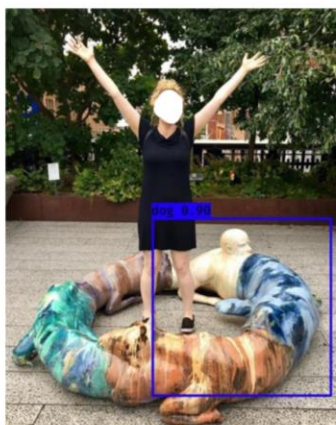
e. art sculpture as dog