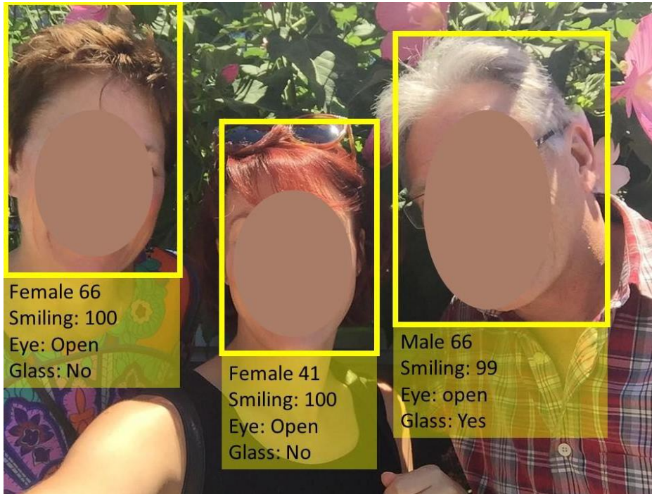
Figure S2. Examples of face detection results from FacePlusPlus