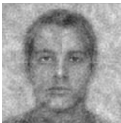
Black Group-Level CI

Face rating images (presented in random order; full size available upon request):