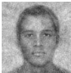
White Group-Level CI