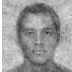
White Group-Level CI