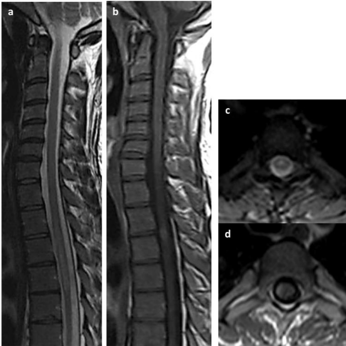
SUPPLEMENTAL FIGURE 1 Dorsal spine images from a confirmed case of toxocara myelitis to compare to images from our illustrative case. 36 year old man with a 9 months history of paresthesia (sensory level at T4) and dysesthesia in bilateral lower extremities and urinary intermittency.

Sagittal T2 weighted images of the thoracic spine showing enlarged cord with high signal intensity at T2-T4 level (a) with focal nodular enhancement following contrast administration (b). Axial images demonstrating the signal abnormality in the center and laterally in the cord (c) with a peripherally located focal nodular enhancement along the right aspect of the lesion (d).