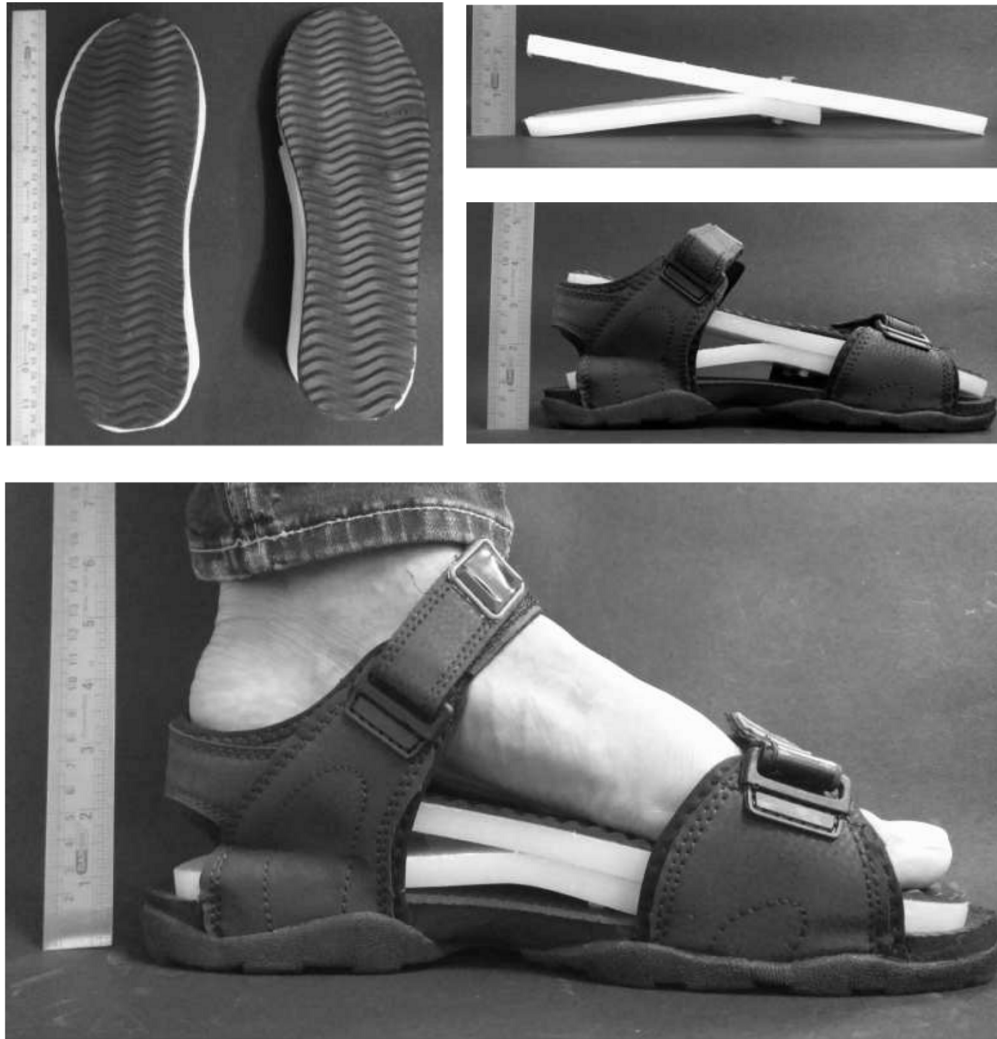
Figure A1 – The orthotic insert used in this study various orientations and after insertion into the shoe, and foot placement.