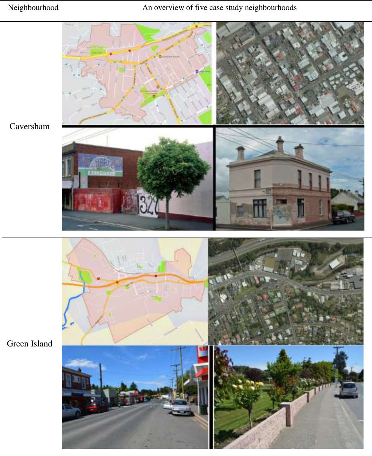
Table S2. Neighbourhood boundary map, aerial map, and images of each case study neighbourhood