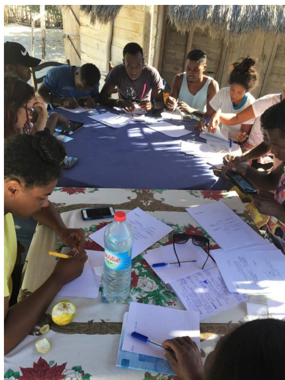
Figure S10: Fish workshop participants study for a fish bone quiz.