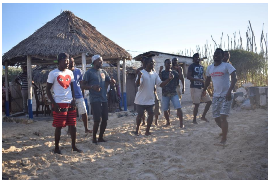
Figure S12: MAP team rehearsing original song about archaeology and the MAP composed by BVP.