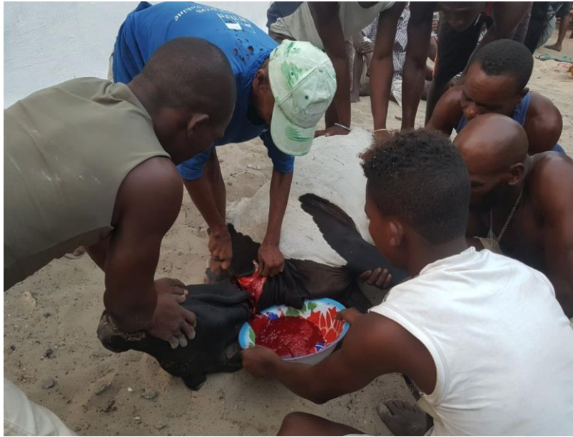
Figure S3: Zebu sacrifice to the Razana in thanks for the successful conclusion of the MAP 2017-2018 oral history survey of Velondriake.