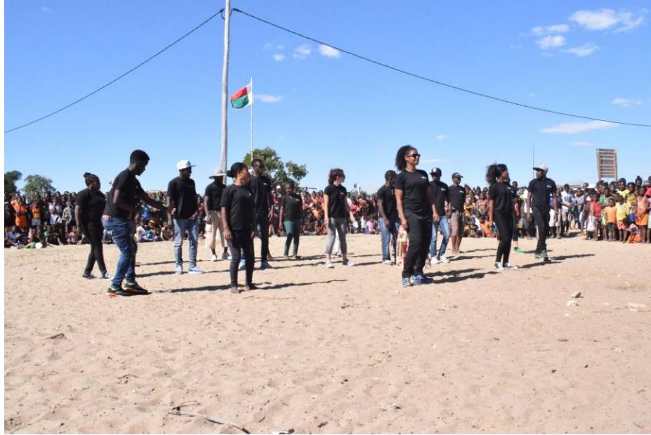
Figure S13: MAP team stands before the Mayor and other officials in Befandefa for their Malagasy Independence Day performance on June 26th, 2018.