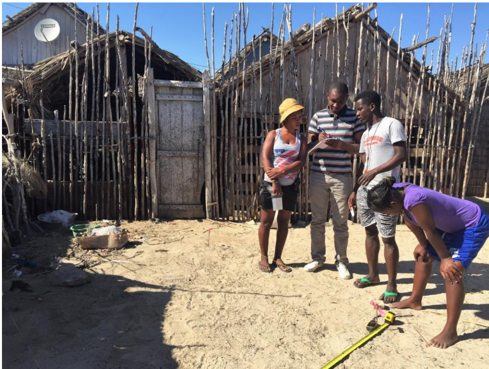
Figure S8: A group of fish workshop participants set up their collection site to carry out an ethnoarchaeology study.