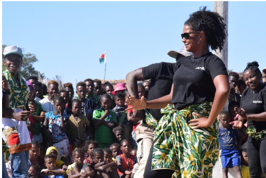
Figure S14: MAP team performs original song by BVP and dance choreography for Independence Day.