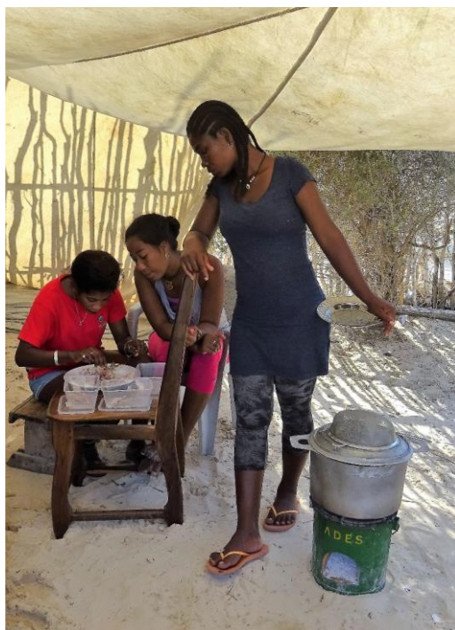
Figure S9: MAP team members boil fish using an adesy and remove flesh from a fish skeleton as they prepare collection specimens under the shade of the MAP lakalay (boat sail).