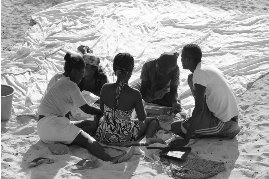
Figure S7: MAP team sorts shellfish remains at the site of Antsaragnangany using a lakalay (boat sail) as a lab bench.