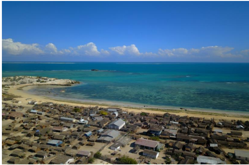
Figure S1: Village of Andavadoake, MAP base, Velondriake Marine Protected Area, Madagascar.