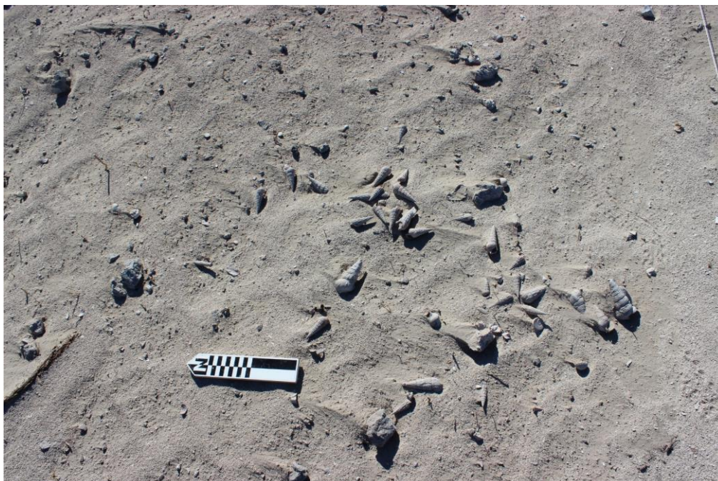
Figure S5: Concentration of archaeological shellfish in Velondriake.