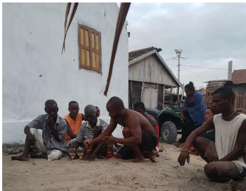
Figure S2: Olo Be perform a blessing and libation to the Razana .