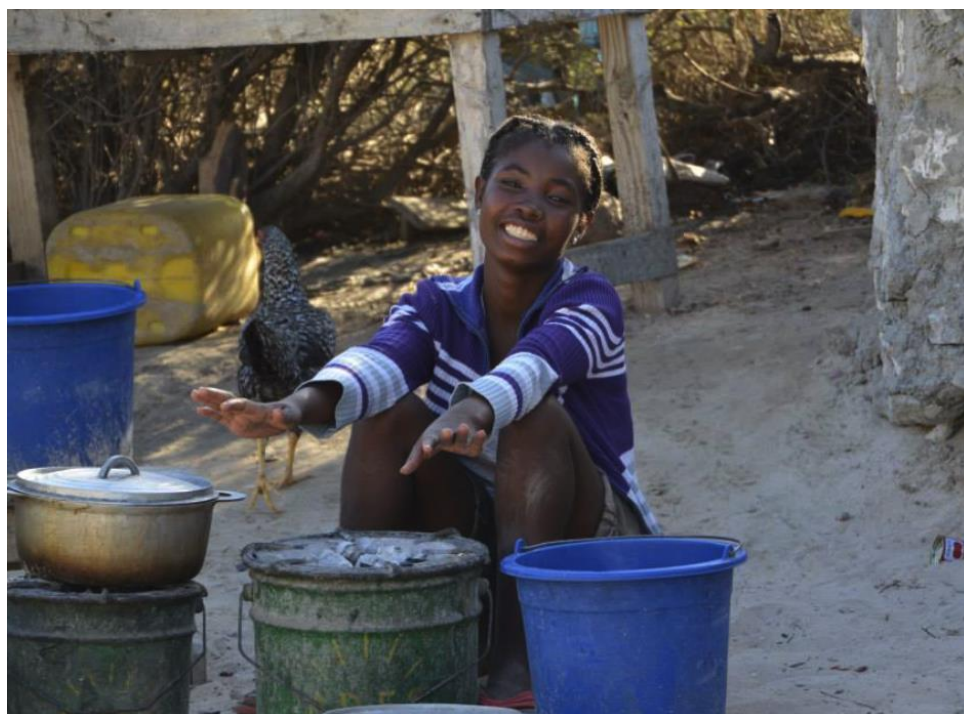
Figure S6: PS cooks rice on charcoal stoves while discussing the day's archaeological finds.