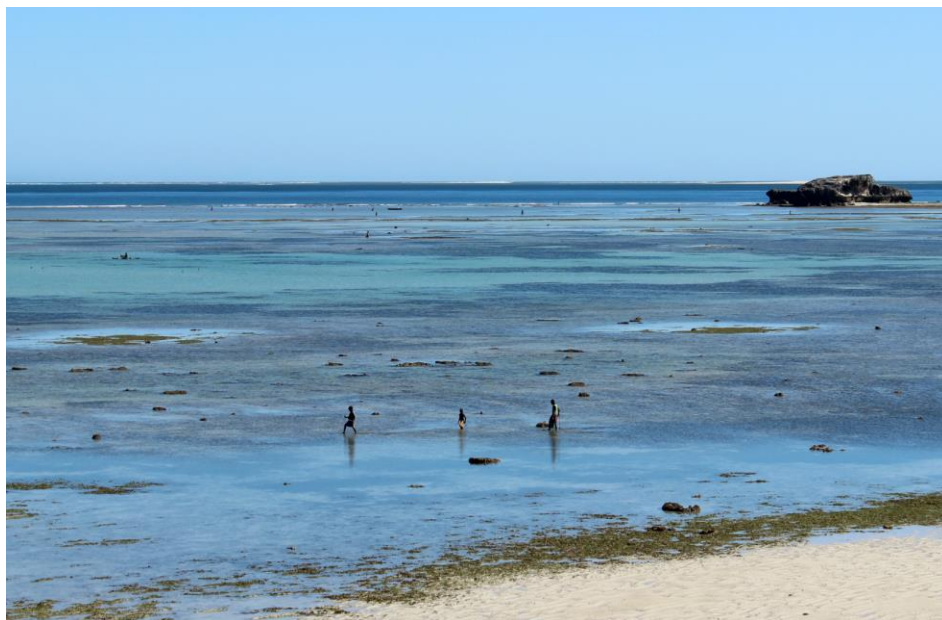
Figure S4: Vezo women gleaning for shellfish and other resources at low tide.