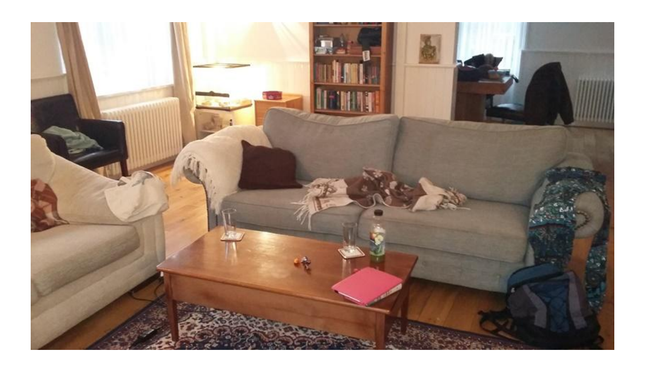
Part 1 – T1 victim blame items (see above - as per Study 1)